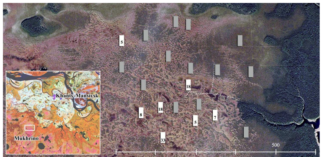
Figure 2. Location and abundance of A. turficola at the study site (satellite QuickBird image of NW part of Mukhrino bog). Gray marks the plots without collections; white – with number of apothecia per plot; dashed line marks the boardwalks of Mukhrino field station

Hepatico-Rhynchosporetum albae Bogd.-Guiheneuf 1928. This association produced most of the registered collections; apothecia were collected on sides of hollows, on liverworts covered peat surface with admixture of different plant remains. Apothecia there were usually small, turbinate or short-stipitate, up to 1 cm high and with the disc up to 5 mm wide.